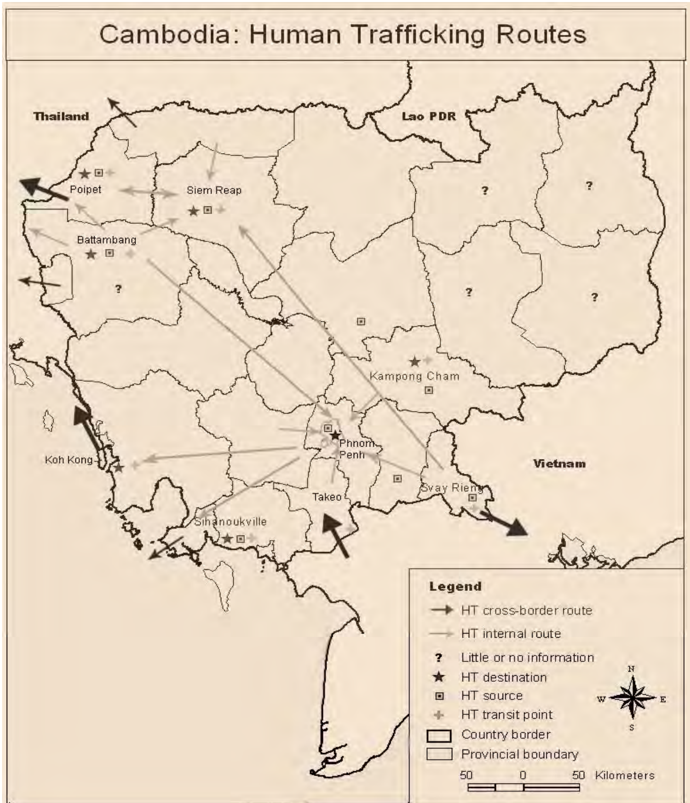
Figure 3. United Nations Inter-Agency Project on Human Trafficking (UNIAP): Phase III March 2008 (v.1.0)