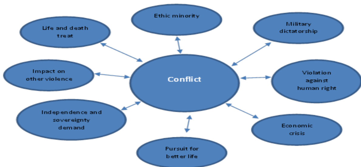
Figure 1 Causes of Conflict Leading on Migration of Burmese Women into Thailand

Causes of conflict that led to migration of Burmese women into Thailand are complicated, including ethnic minorities, military dictatorship, violated human rights, poverty and pursuit of better life. In conflict situations, women are the most affected. Burmese migrant women encountered forced labour, human trafficking, exploitation, violence and sexual abuse. Figure 1 below represents synthesis of conflicts which led to migration of Burmese women into Thailand;