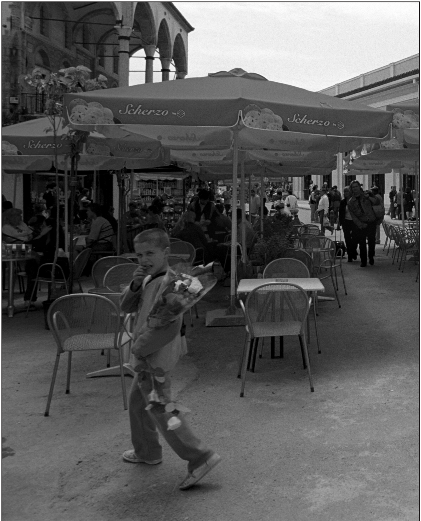
Boy selling flowers in a cafe. Construction to the right hand side and in the background for the Olympic Games 2004. Monastiraki Athens.