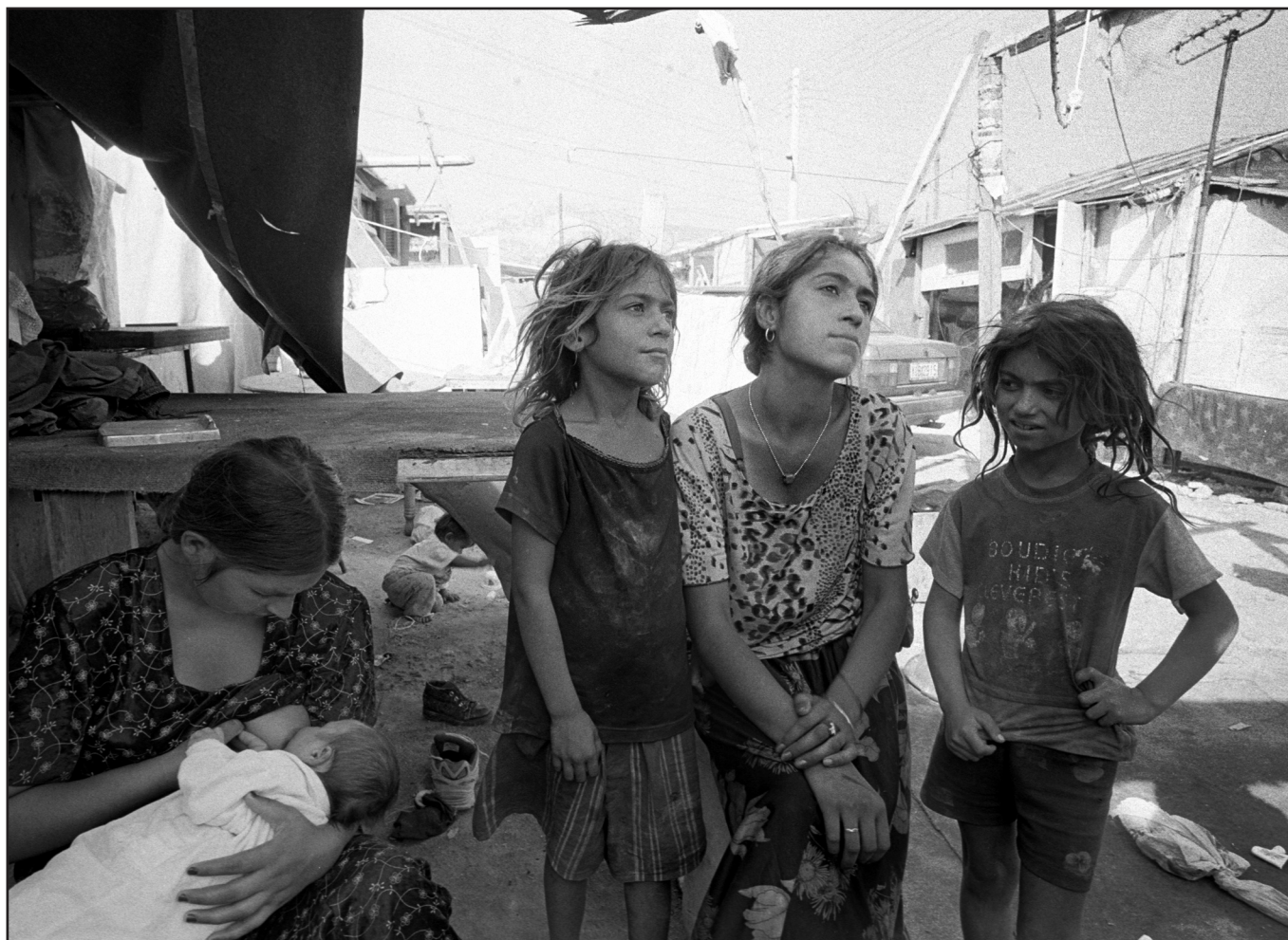
Life conditions of Albanian families, Athens.

The EU approach to humanitarian interventions recognises that special care must be taken to protect children in emergency situations who are especially vulnerable, and thus all programmes are to have a special focus on children's welfare. Whilst such measures can contribute to the protection of children from trafficking there is also a need for specific measures, both during the emergency itself or in the rehabilitation period, which are not currently present in EU policy.