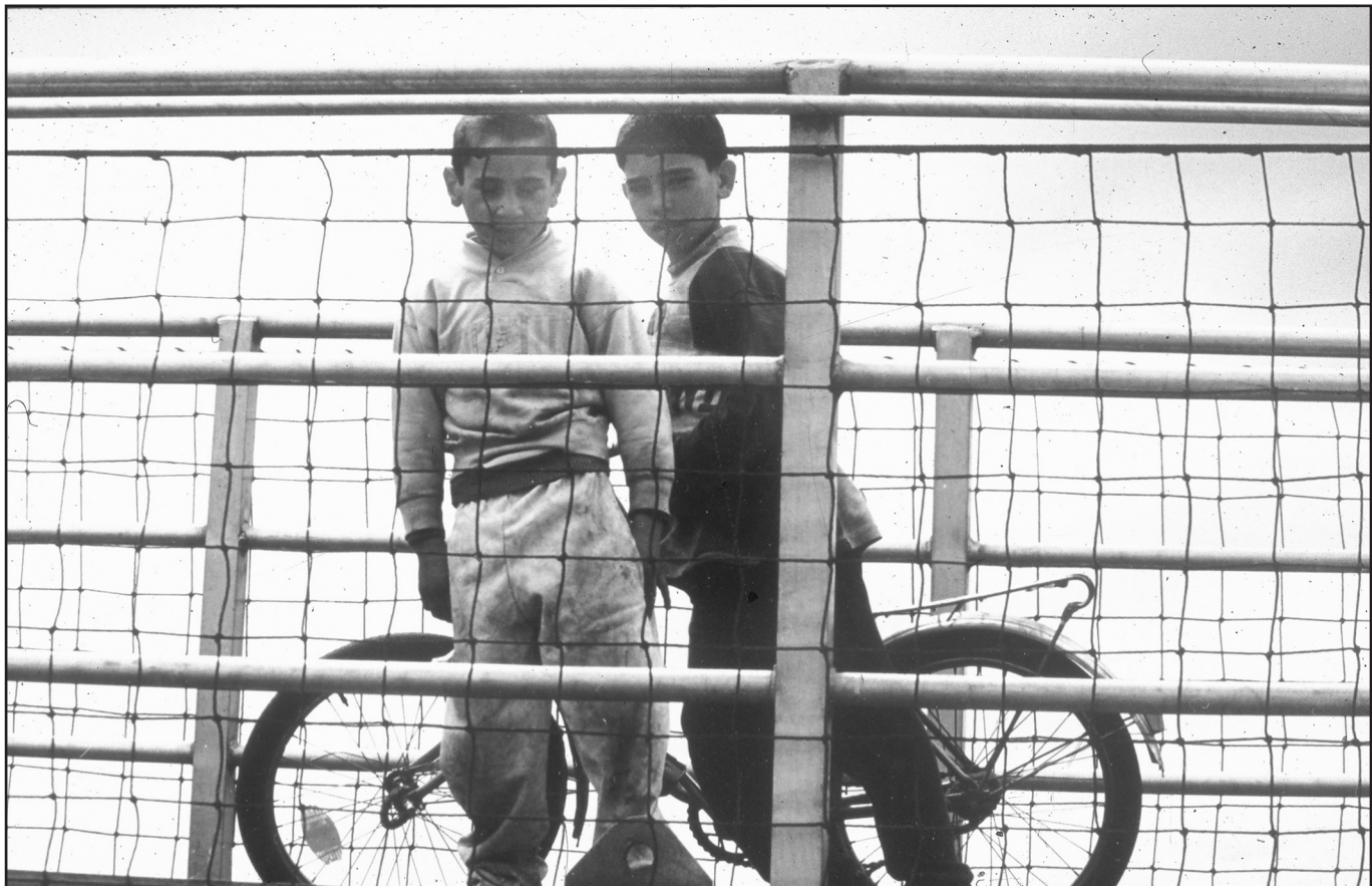
Boys being forced to steal by criminal gangs, Hamburg

In addition, the current approach focuses extensively on prosecution of traffickers and so where provisions exist for victim protection they tend to be relevant only to those victims who choose to testify against their traffickers. These tend to be adults. Any instrument that is to contribute to the fight against child trafficking must include a series of measures for the protection of any child that is identified as a victim of trafficking regardless of whether or not he or she chooses to be involved in criminal proceedings.