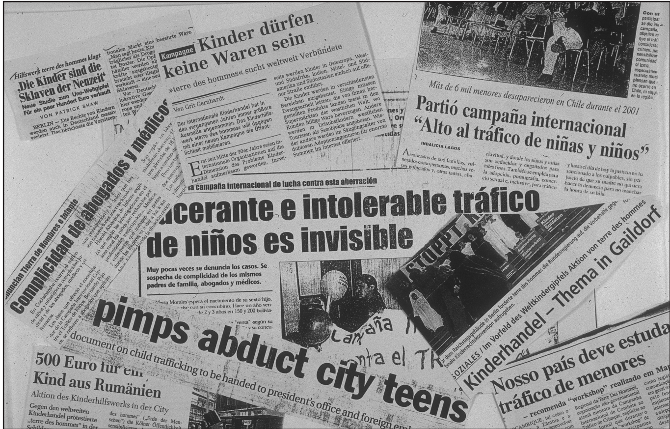
Child Trafficking is becoming an increasing concern in public opinion

development and humanitarian relief, as well as to child trafficking more specifically. It has been compiled through extensive document analysis as well as numerous interviews with institutional stakeholders at EU level involved in the fight against child trafficking.