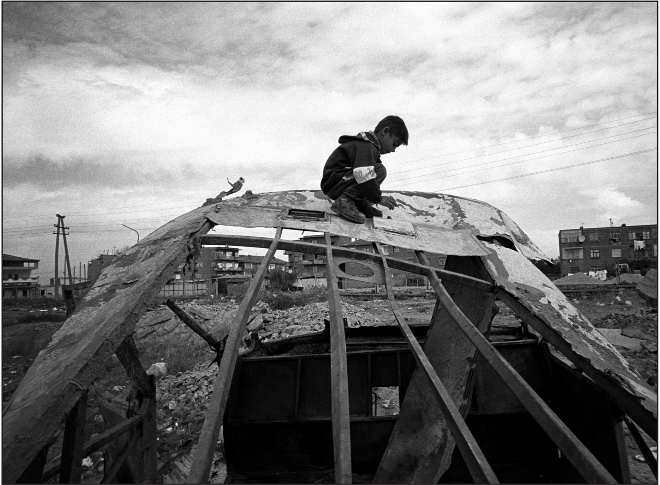
Kid playing in the surrounding of his house, Albania.