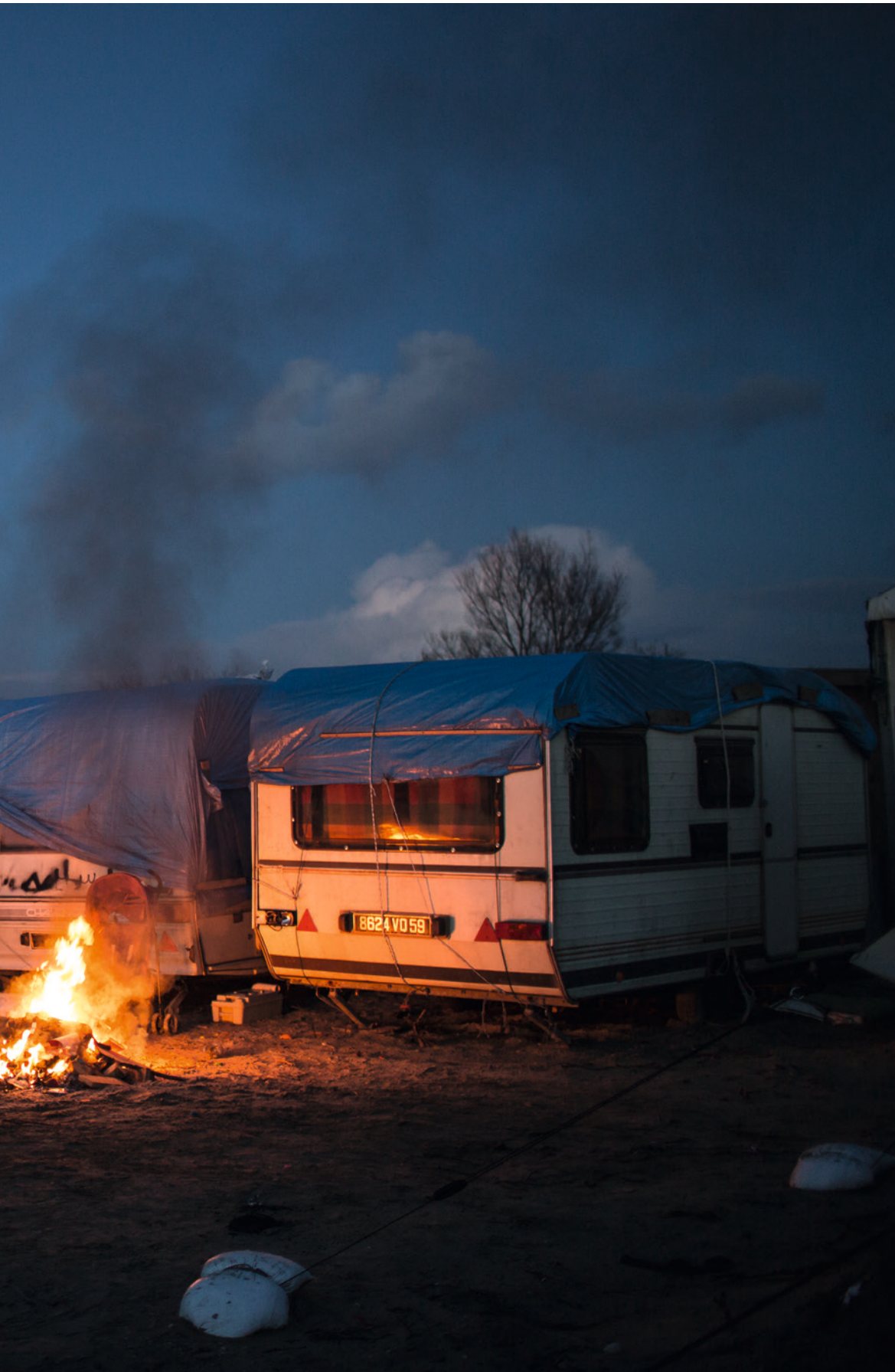
Slums of Calais, February 2016.