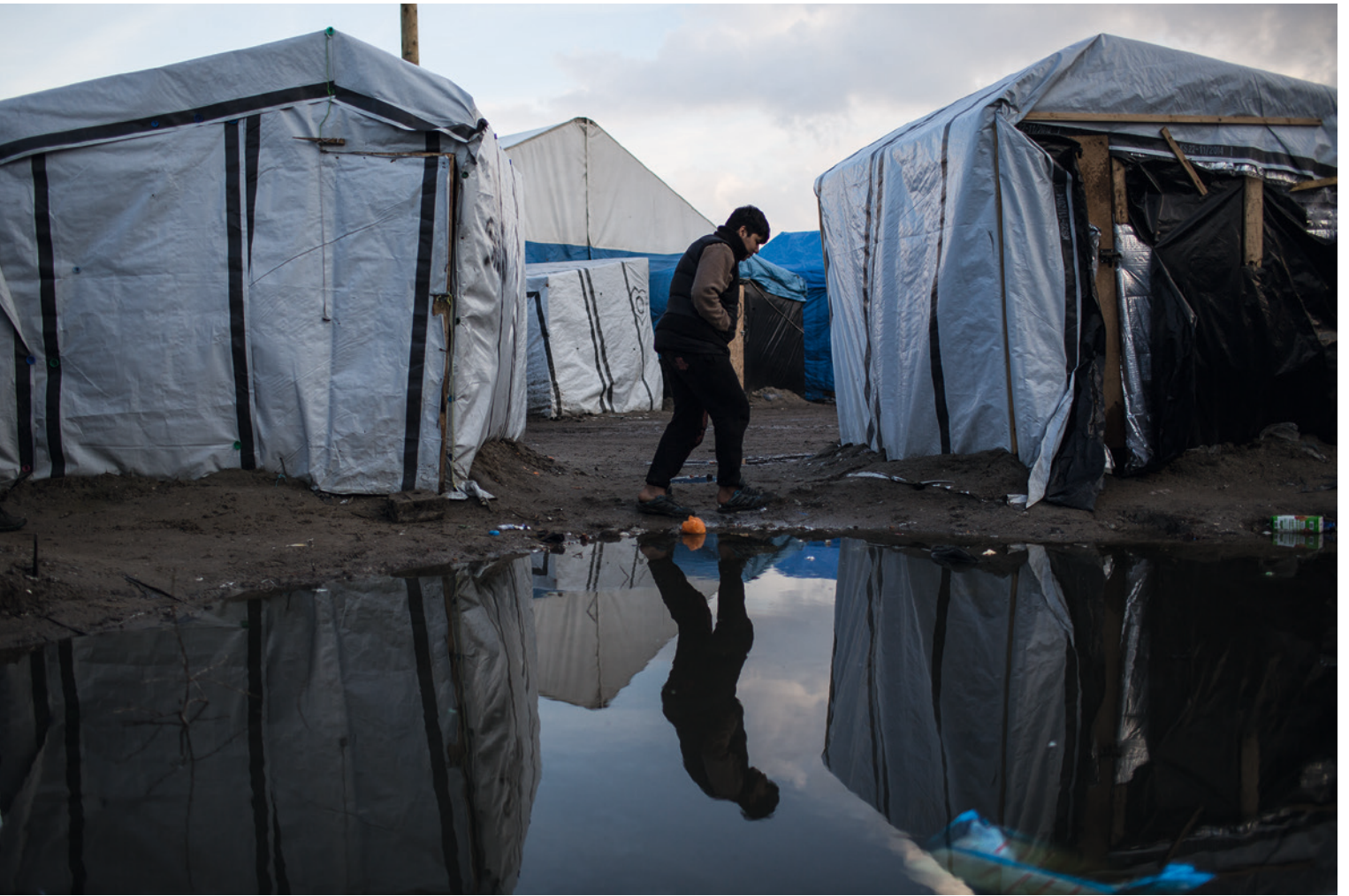
↑ Afghan unaccompanied minor in the slums of Calais, February 2016.