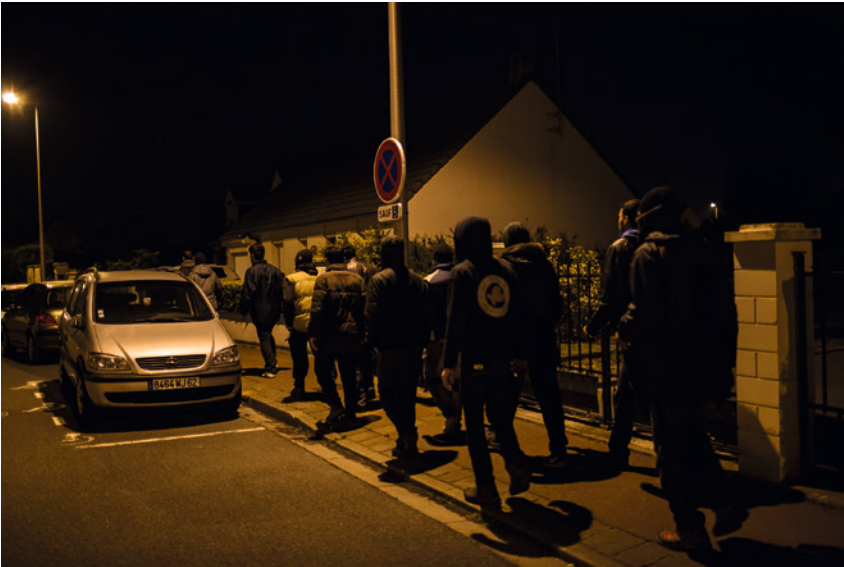
← Attempt to cross the border to England, May 2016. ↓