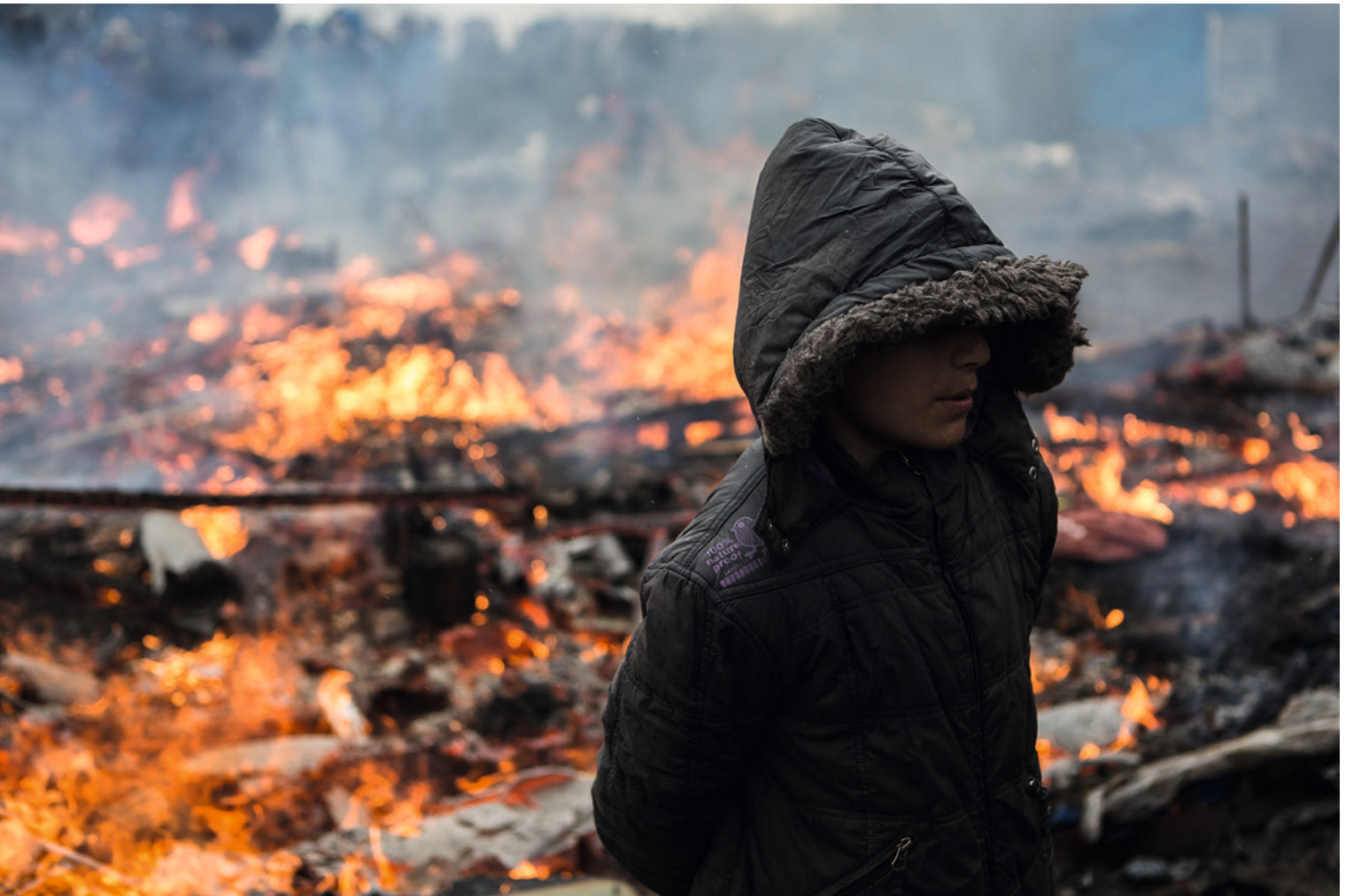
↑ Dismantling of the South zone of the "jungle", 1 March, 2016.